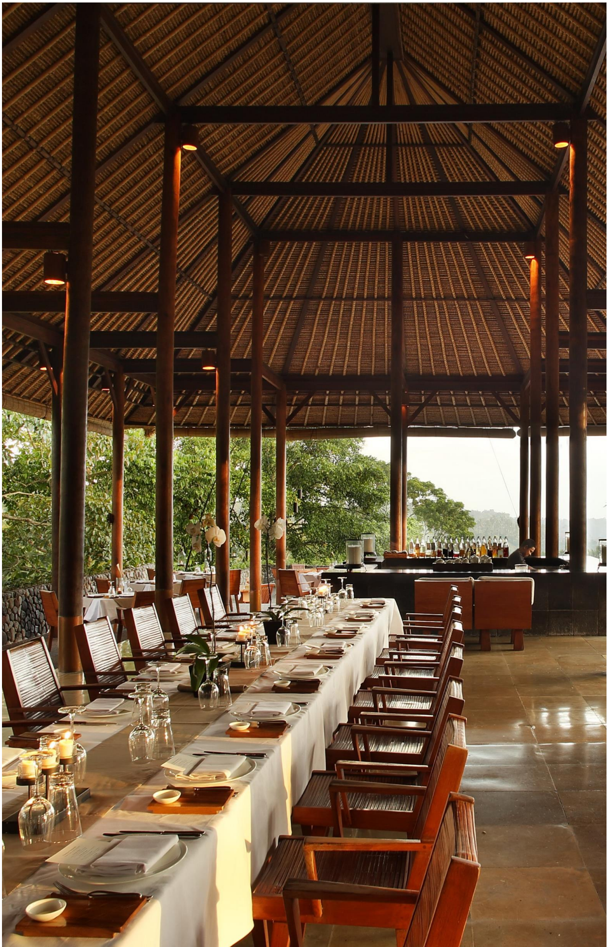
A Timeless Tradition Since 1996