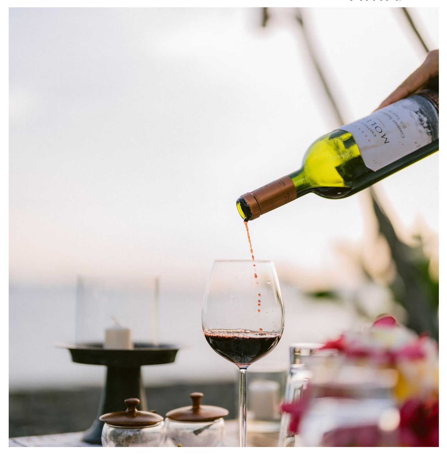
TABLE BY THE SEA

5-Course Menu with A Bottle of House Wine | IDR 1,950,000++ per couple