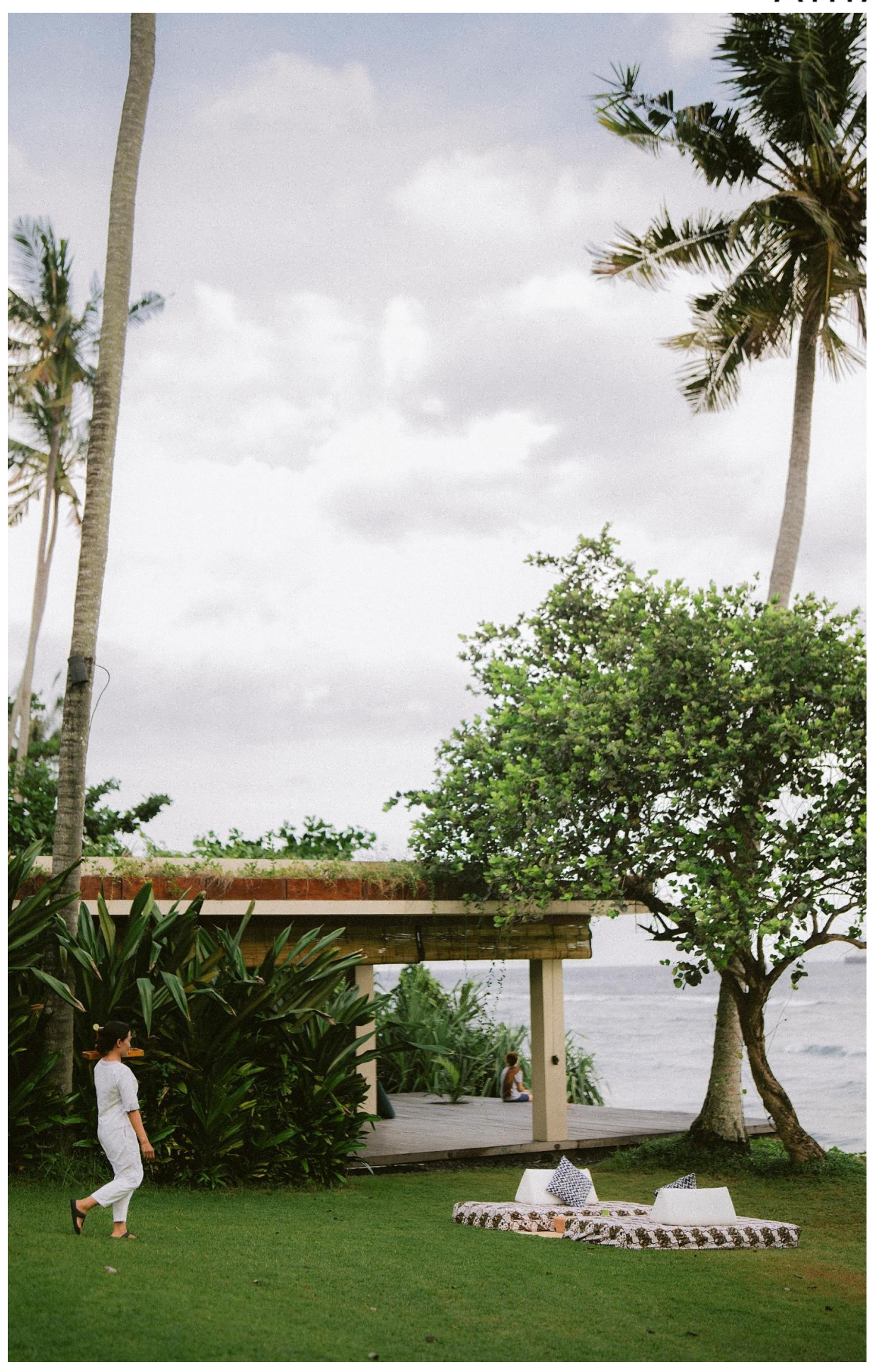
30 years of legacy since 1994