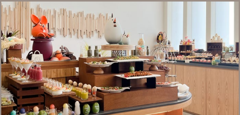
Prices are in USD and subject to 16% GST and 10% service charge. Reservations must be made at least 24 hours in advance. Please contact your

6.30pm - 10.00pm at Seasalt restaurant USD 150++ per person (for non meal packages)