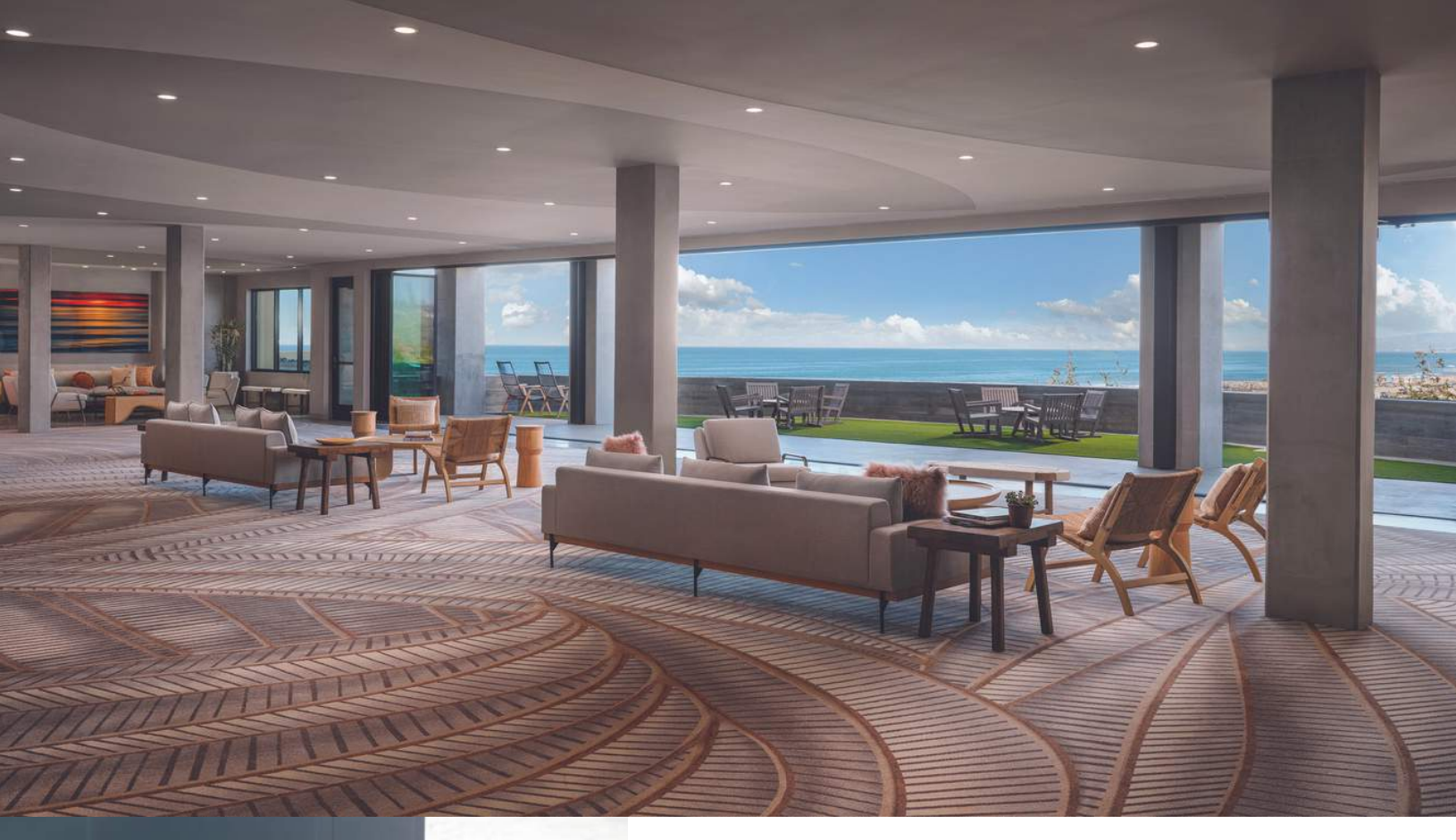
Click photo above to explore a 360-degree view of the space.